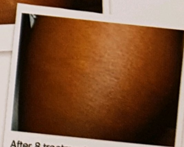
After 8 treatments